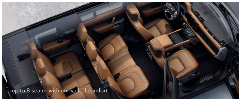
up to 8-seater with unrivalled comfort