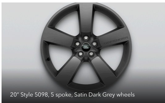
20" Style 5098, 5 spoke, Satin Dark Grey wheels