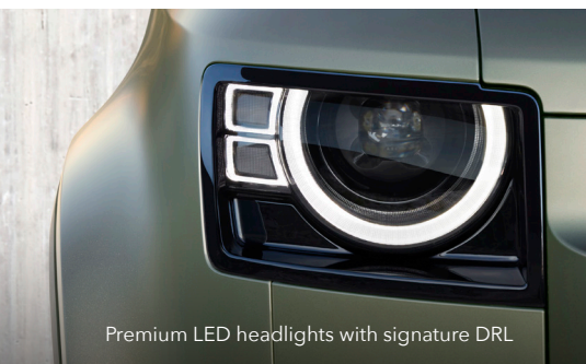
Premium LED headlights with signature DRL