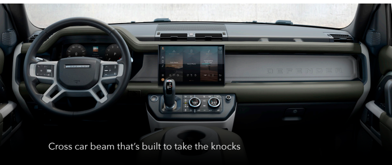
Cross car beam that's built to take the knocks

The Defender 130 is the rebirth of our most iconic Land Rover yet—the perfect fusion of form, vertical stance and attitude—built to go above and beyond, on any terrain and every adventure.