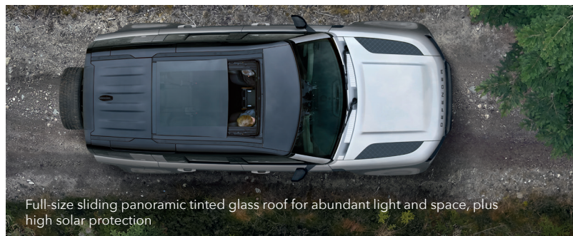
Full-size sliding panoramic tinted glass roof for abundant light and space, plus high solar protection

Authorized importer: PT JLM AUTO INDONESIA Indomobil Tower, 19th Floor, Jl. MT Haryono Kav.11, Jakarta 13330