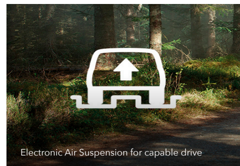
Electronic Air Suspension for capable drive