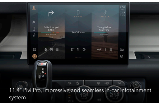
11.4" Pivi Pro, impressive and seamless in-car infotainment system