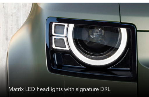
Matrix LED headlights with signature DRL

The Defender 130 is the rebirth of our most iconic Land Rover yet—the perfect fusion of form, vertical stance and attitude—built to go above and beyond, on any terrain and every adventure.