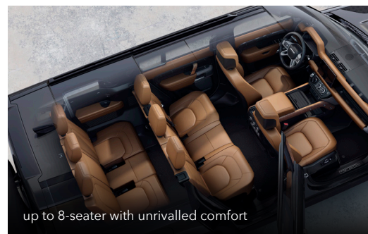
up to 8-seater with unrivalled comfort