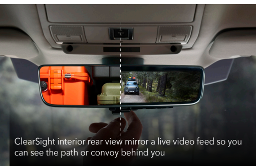
ClearSight interior rear view mirror a live video feed so you can see the path or convoy behind you