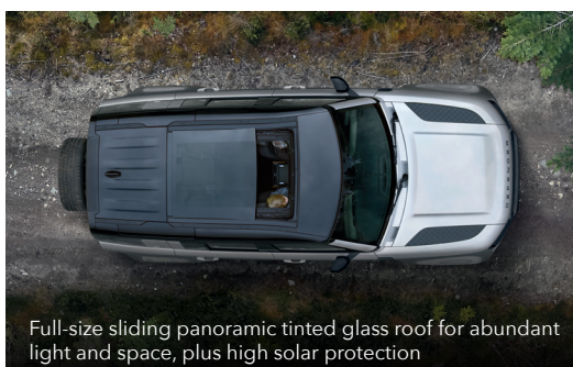
Full-size sliding panoramic tinted glass roof for abundant light and space, plus high solar protection