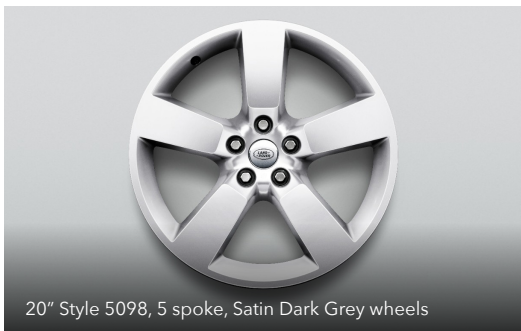
20" Style 5098, 5 spoke, Satin Dark Grey wheels