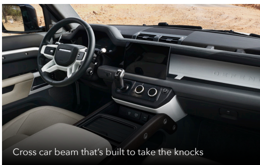
Cross car beam that's built to take the knocks