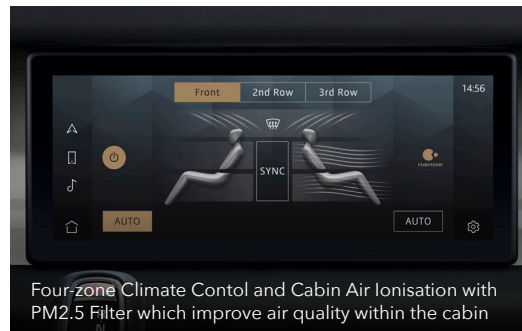
Four-zone Climate Control and Cabin Air Ionisation with PM2.5 Filter which improve air quality within the cabin

Authorized importer: PT JLM AUTO INDONESIA Indomobil Tower, 19th Floor, Jl. MT Haryono Kav.11, Jakarta 13330